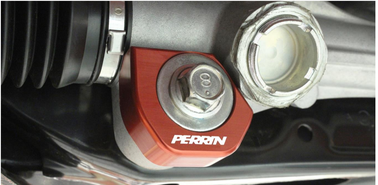
Left Side Pictured Above