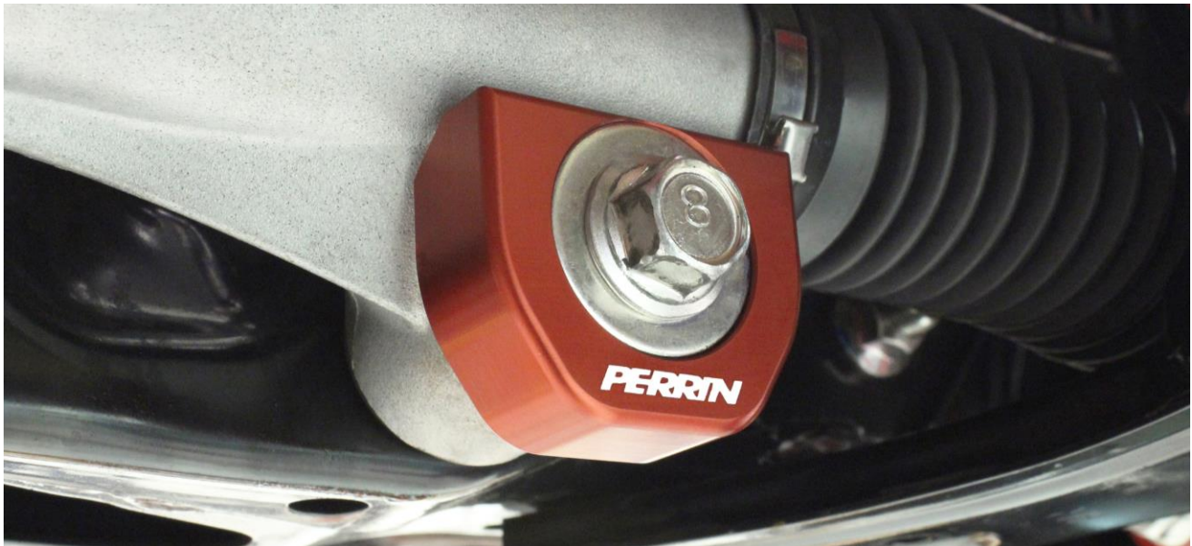
Right Side Pictured Above